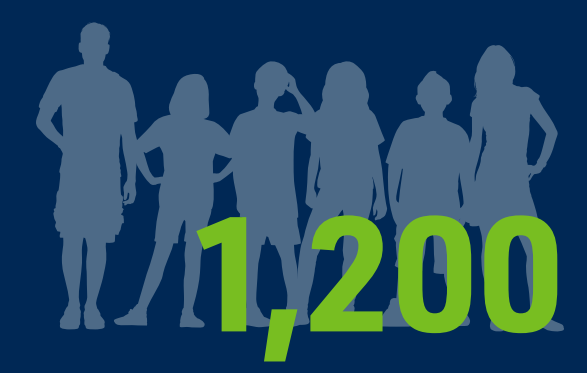
There will be approximately 1,200 study participants.